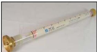
Stem and brass weight