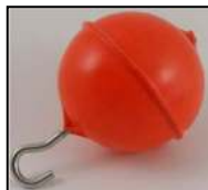
Ball and hook