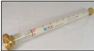
Stem and brass weight