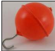
Ball and hook