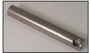
Stainless steel weight