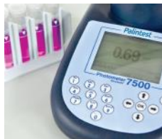
Photometer 7500 - Bluetooth kit