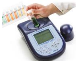
Photometer 7100 - standard kit

The photometers use digital colour analysis to provide repeatable and accurate results even at low concentrations.