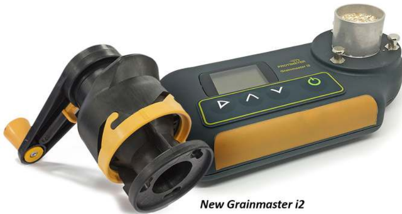
New Grainmaster i2